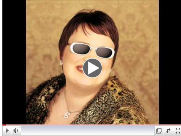
Diane Schuur Cry Me A River